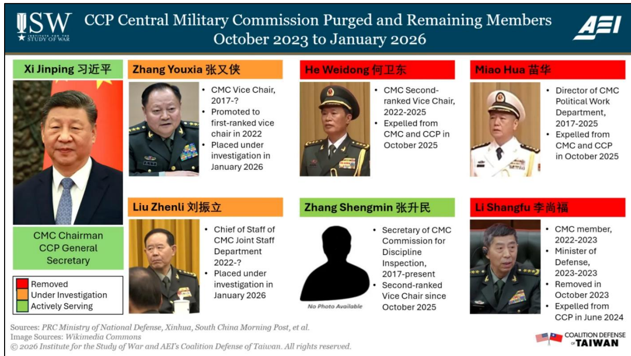
Figure 2: Military officials removed, under investigation, and currently serving.

motivated Xi to enable an investigation on the two officials. But the removal of Beijing’s two remaining combat-experienced officers will most likely enable Beijing to act recklessly in the events leading up to an invasion of Taiwan.