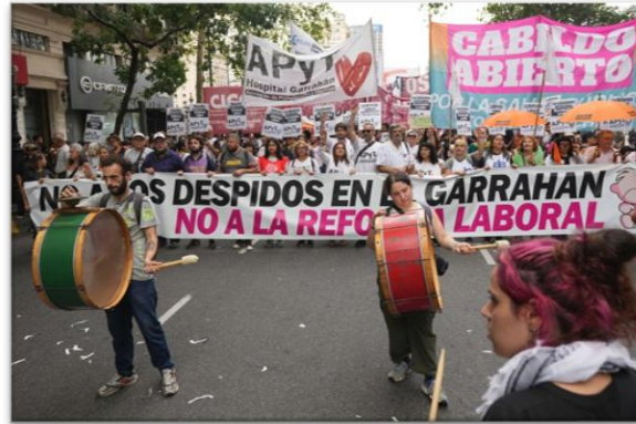
Figure 4: Image of protests in the streets of Buenos Aires.

Increased Opposition: Labor reforms will likely increase political opposition because many workers believe the reforms put businesses and investors first instead of employees. The labor reform bill makes it easier for businesses to fire employees and reduce severance pay, while also changing the workday from 8 hours to 12. Milei's administration argued that the reform will lead