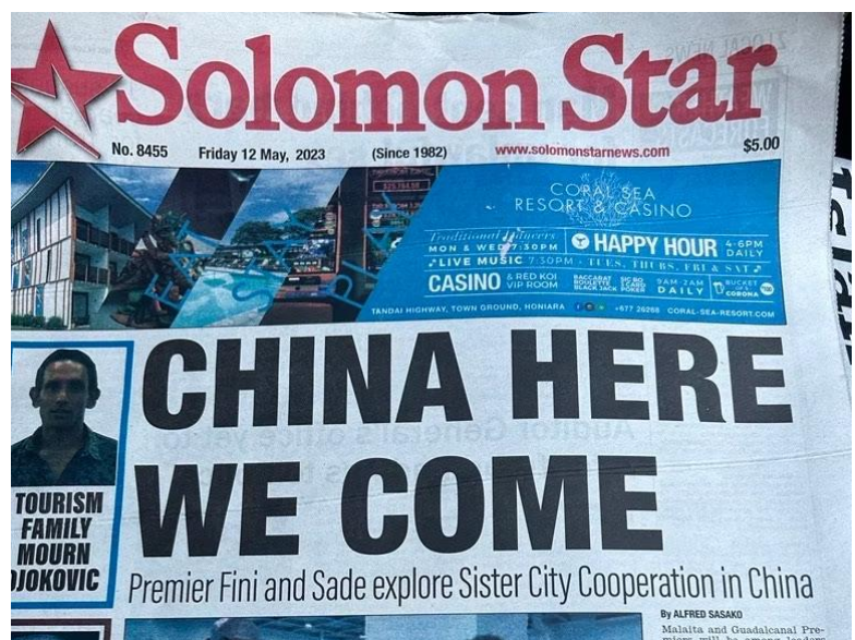
Figure 1: Pro-Chinese newspaper published by the Solomon Star despite claiming independence

Arrangements such as these limit free press, control policy, and create hostility between local and foreign reporters, according to PINA.